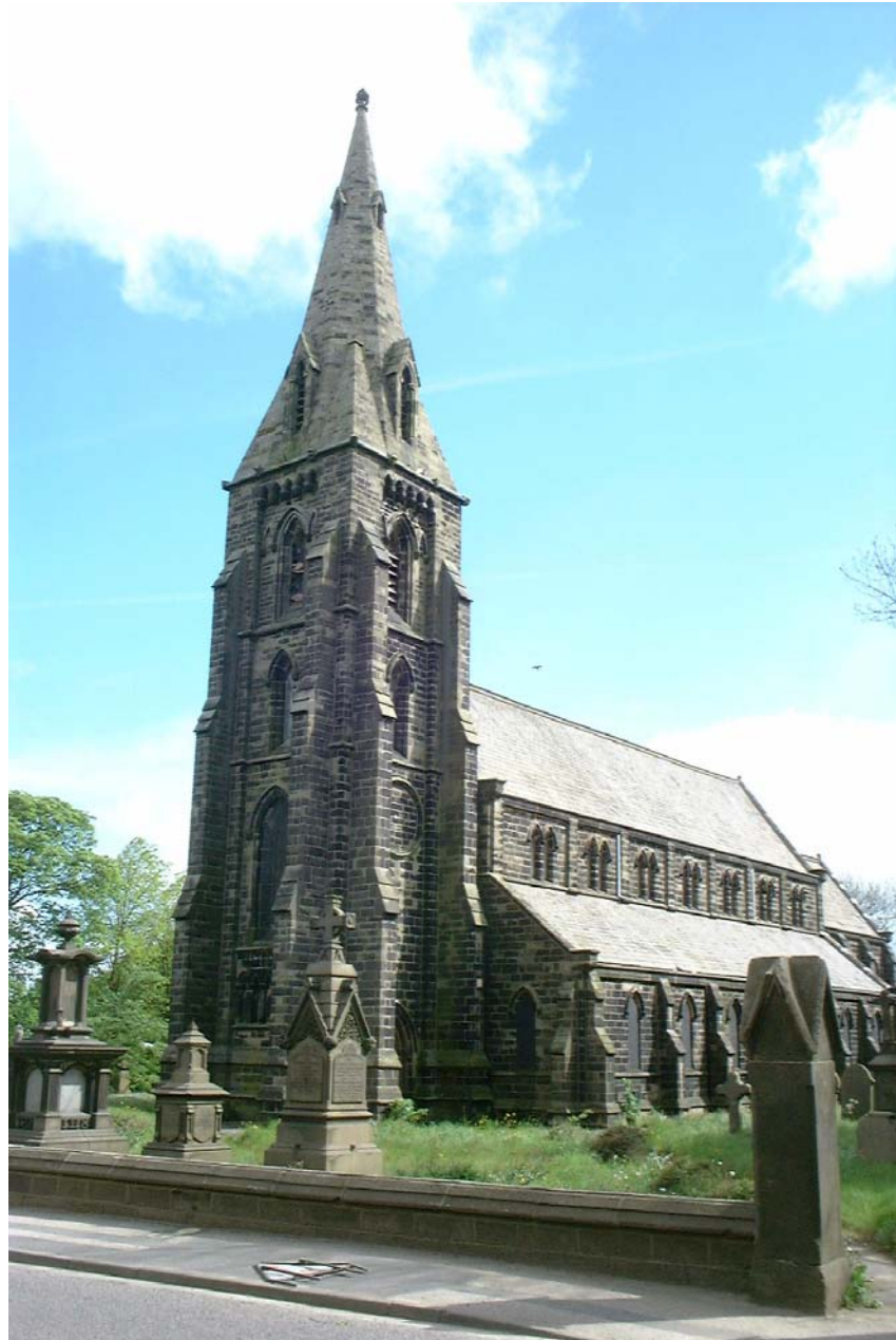
The former church of St Paul, Denholme, West Yorkshire

Helping churches acquire surplus and/or redundant bells to be hung for English-style full-circle bell-ringing.