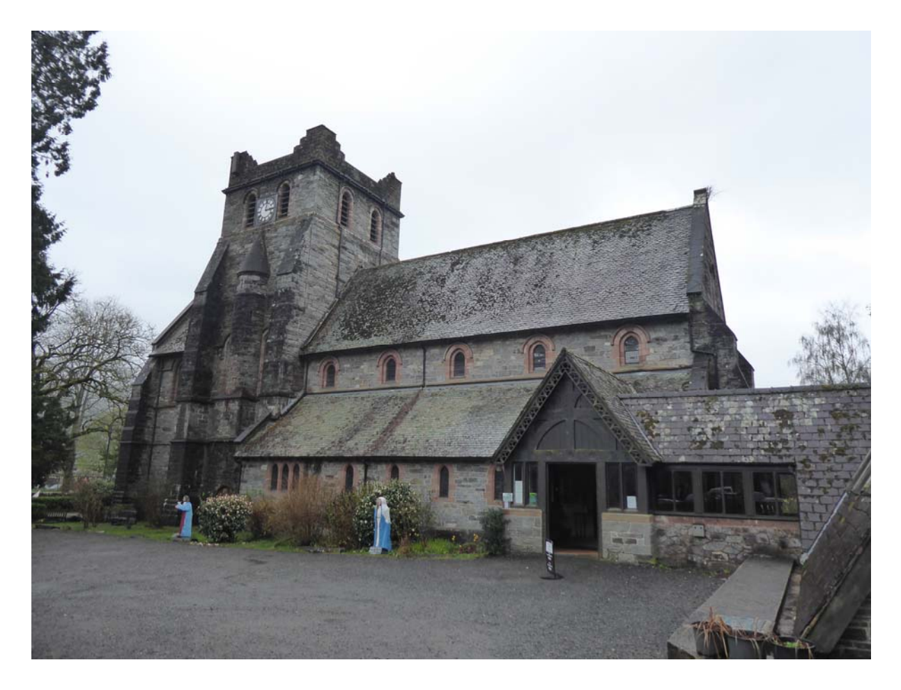
Betws-y-Coed, Gwynedd, St Mary

Subject to fund-raising it is hoped to transfer the ring of eight bells from the closed church of St John, Porthmadog. The bells have now been removed from St John's and are in storage.