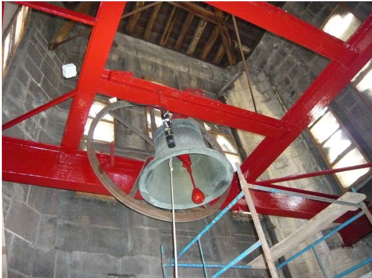
The ex-High Wycombe bell installed in part of the original bellframe.