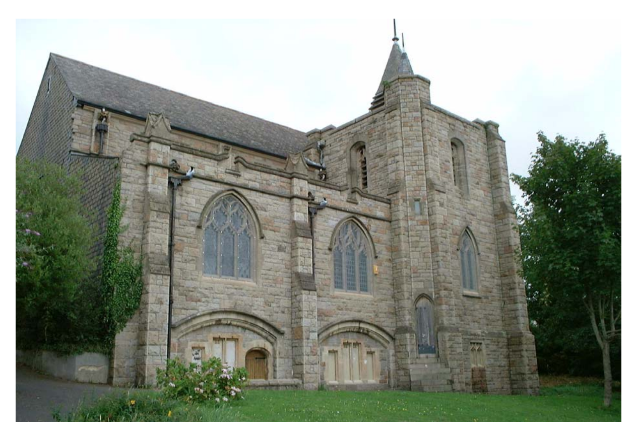
Plymouth, Devon, St Mary the Virgin, Laira

The Trust located a new home for the single bell that was displaced when the ring of bells was installed in 2000. The original bell is now at a church in Dowlais, Merthyr Tydfil.