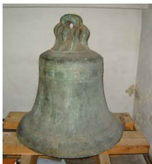
Photograph of the medieval bell from Upton Grey

The Trust has helped to locate exhibits for the Bell Tower. They include a medieval bell from Upton Grey, Hampshire and sets of tubular chimes from Christ Church, Prestatyn, Clwyd; Hardwick, Northamptonshire and Hugh Town, Scilly Isles.