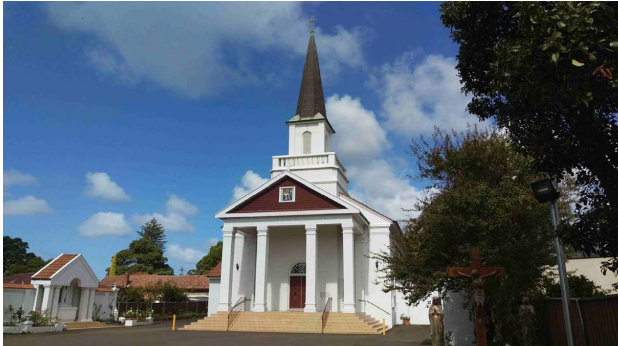
Photograph of Bexley church © Tom Perrins.

It is proposed to install a light ring of six bells. Three bells have already been located for the project; the proposed tenor bell is an ex-Trinity House buoy bell; the 5 th is a bell acquired in 1995 from a UK bell-hanger and used as a bell-ringing demonstration bell in Australia; the 4 th was acquired in 1986 and used by Dave Kelly to understand how bells make their sound and used in our “Sound of Bells” article.