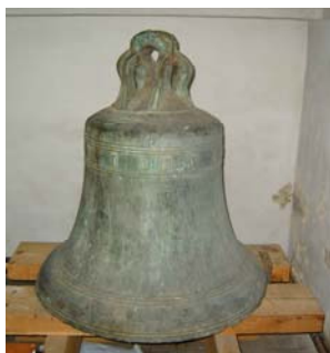
Photograph of the medieval bell from Upton Grey

The Trust has helped to locate exhibits for the Bell Tower. They include a medieval bell from Upton Grey, Hampshire and sets of tubular chimes from Christ Church, Prestatyn, Clwyd; Hardwick, Northamptonshire and Hugh Town, Scilly Isles.