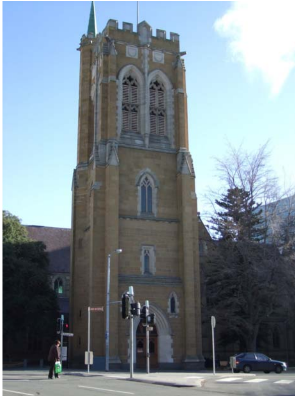
St David's Cathedral, Hobart